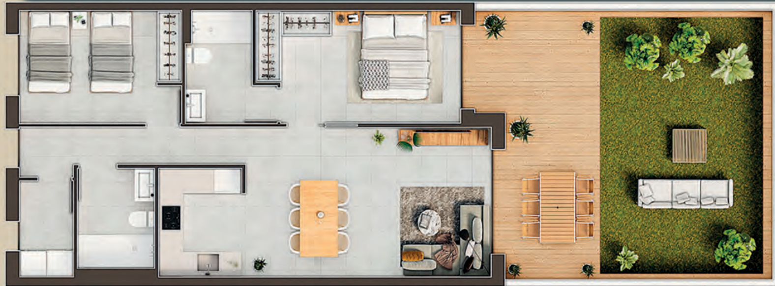
APARTMENT 2 BED PROPERTIES